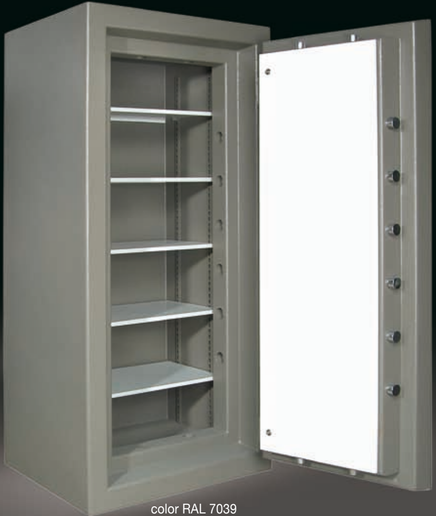
color RAL 7039