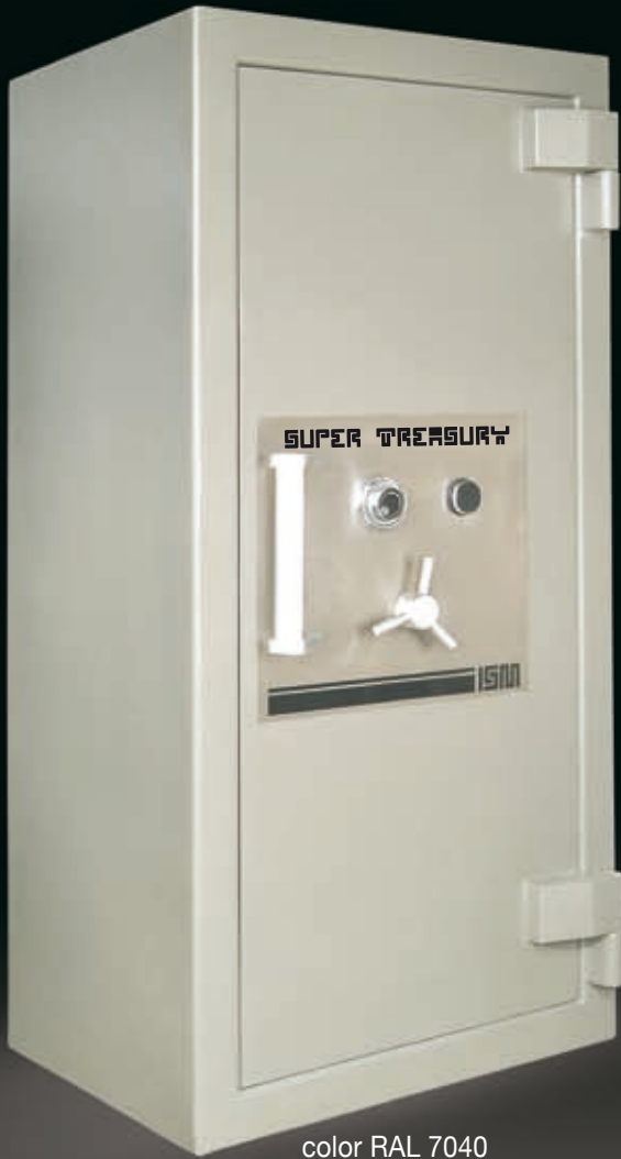
color RAL 7040

For protection of: Cash, diamonds, jewelry, valuable documents, etc.