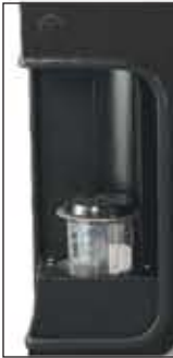
Optional fully integrated video with motorized tubing