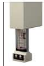
Upsend Two-Sided Manual (Rear View)